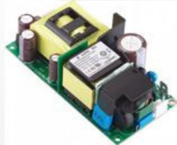
I.T.E. / Medical Open Frame - 200 Watt S...