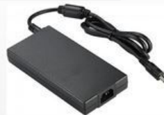
(NEW) 270 Watt Series - Small Size Desk...