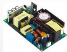
I.T.E. / Medical Open Frame Dual Output ...