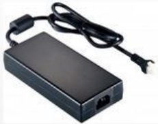
I.T.E. / Medical 300W GaN Series